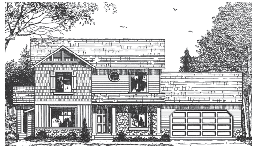
Additional elevations (floor plans may vary slightly)

BRETT FROST OR STEVE MADDOX 801-369-0428 801-602-9839